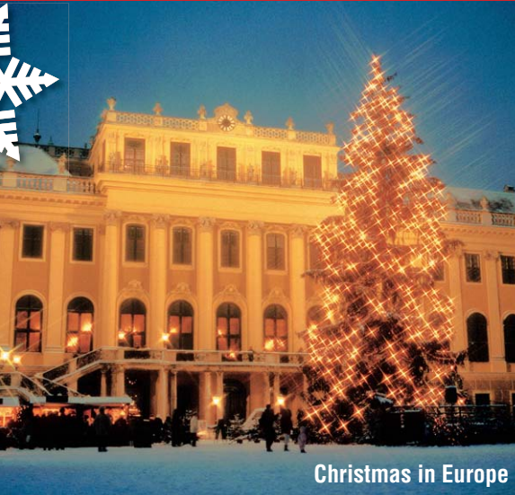
Christmas in Europe