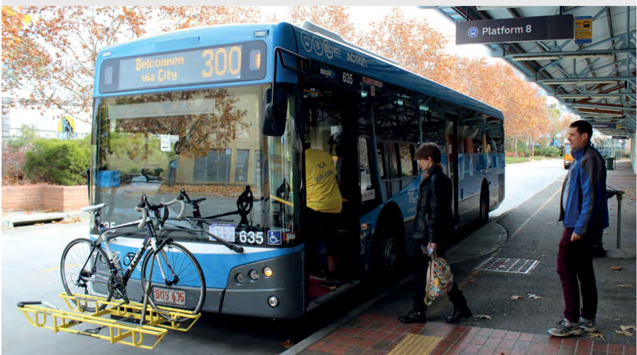
Figure 2: Canberra Bus.