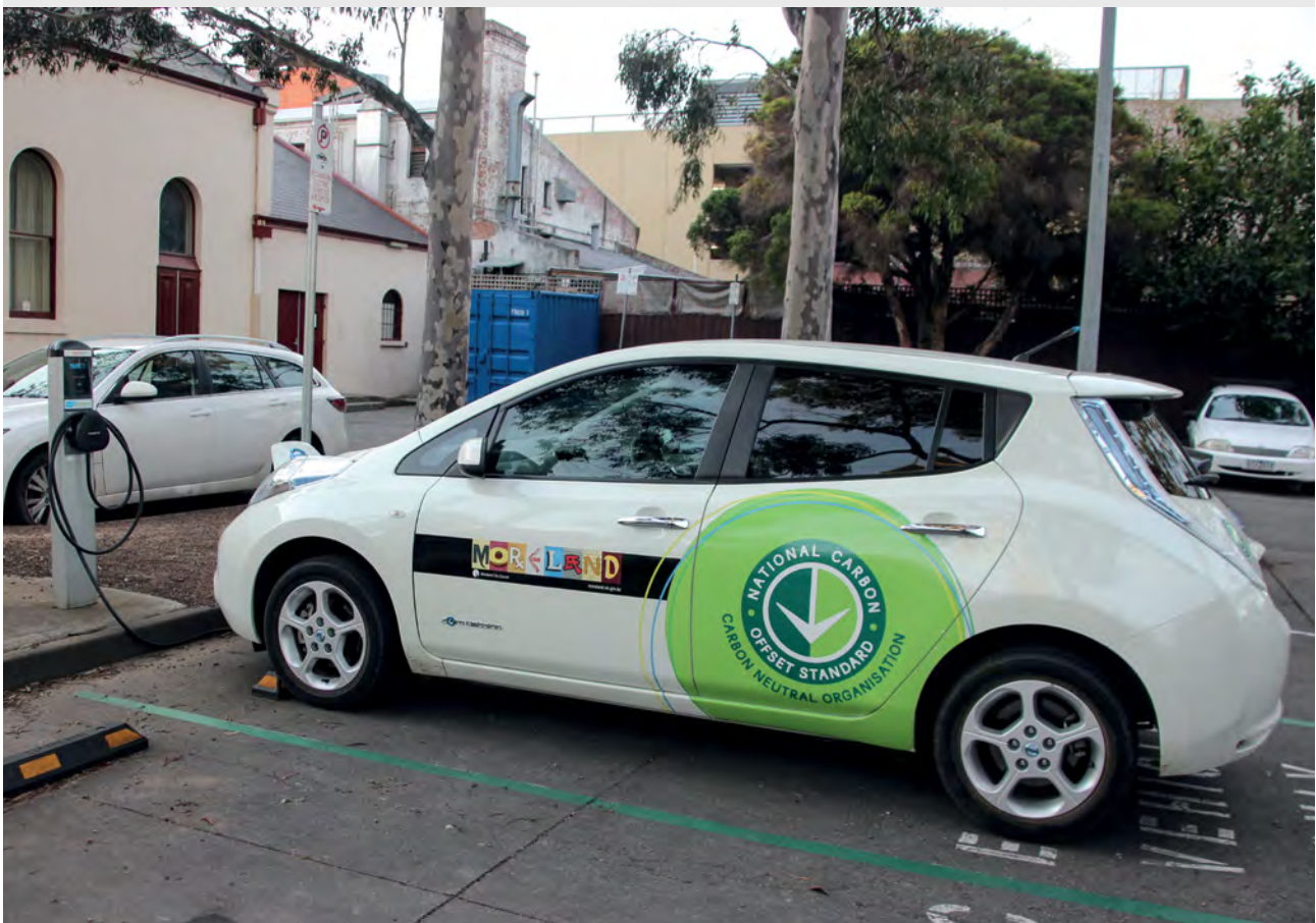
Figure 4: One of Moreland City Council's electric vehicle charging points.

for residents who don't own a car. In 2012, the council installed Victoria's first electric vehicle charging station, it now has three charging points throughout the city, and is integrating electric cars into its council fleet. The council has strategies to encourage walking, cycling and public transport in Moreland.