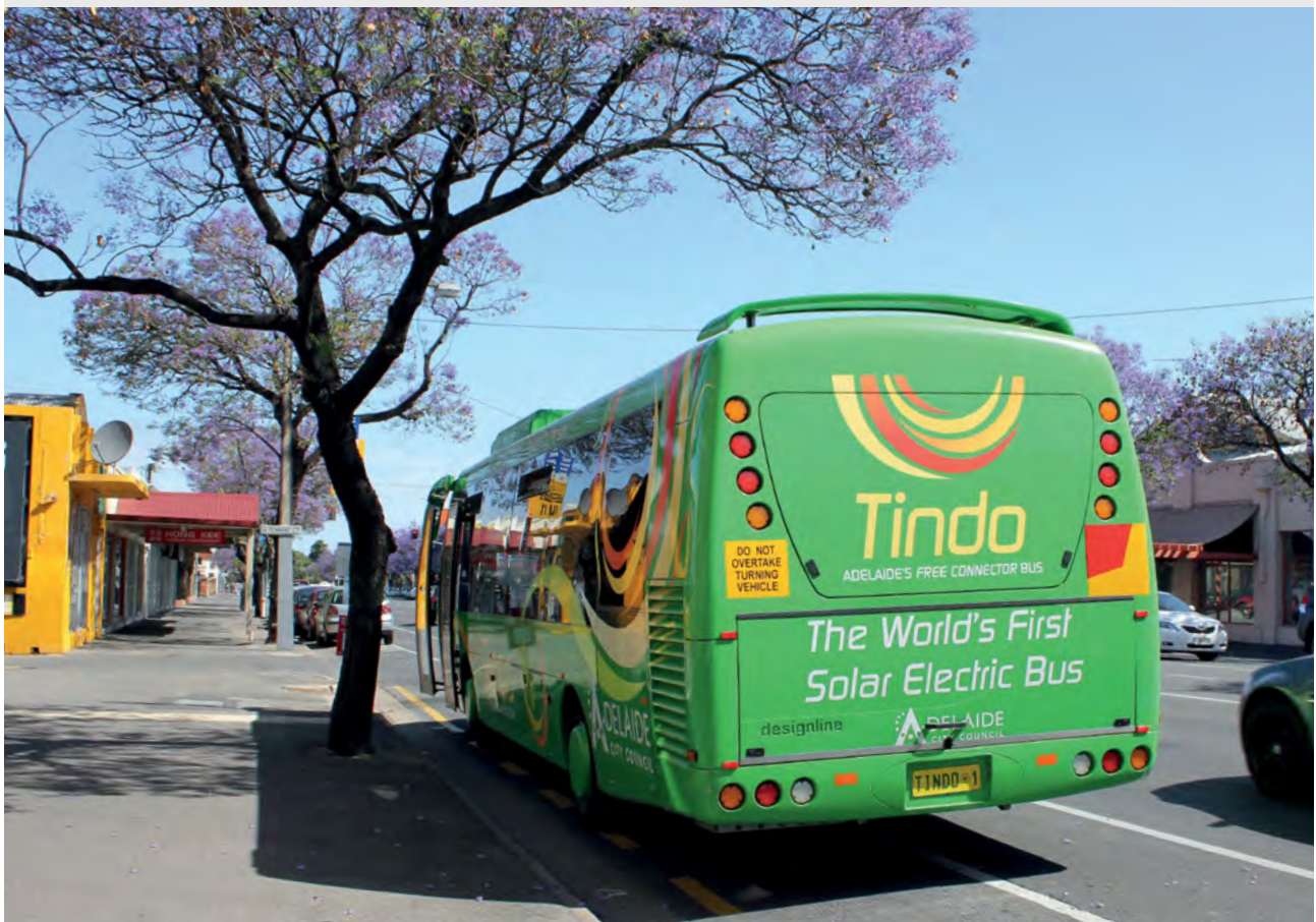
Figure 1: Adelaide's world-leading solar electric bus.

In July 2017, the first Australian designed, engineered and manufactured electric bus rolled off the production line and onto Adelaide's streets, becoming part of Adelaide's public transport network. The success of this project has seen the manufacturers Precision Buses contracted to produce 50 more low carbon buses for New South Wales, Queensland and Victoria. This will increase the number of employees at the organisation from 29 to 79.