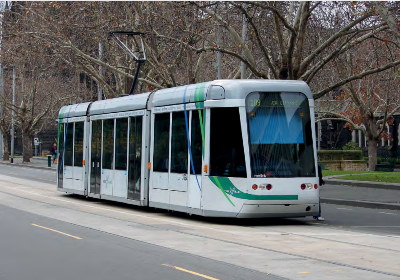
Figure 3: Melbourne's trams will soon get all their electricity from solar plants.

Victoria's tram network is one of the largest in the world, with 200 million boardings every year. The entire tram network will soon be powered by 100% renewable energy, with the construction of 138MW of solar capacity by the end of 2018. The Bannerton and Numurkah solar farms in northern Victoria are being built after winning a Victoria government tender in 2017.